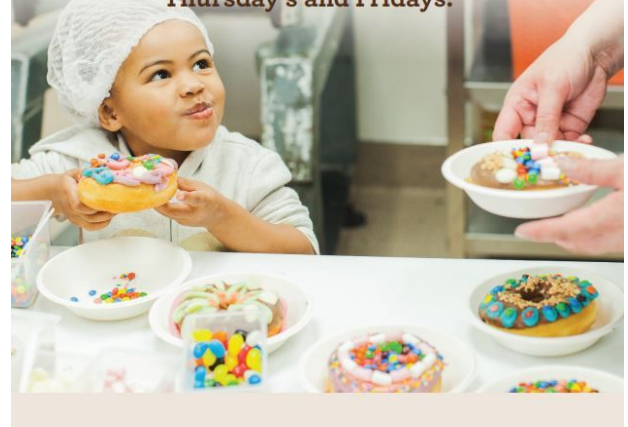
Decorate a donut for only $5 at The Base these school holidays. 10-1pm Thursday's and Fridays.

Cnr Duke & Greenwood St, Hamilton Open 7am-1pm Thurs | Fri | Sat www.mamasdonuts.co.nz 0 @ 0