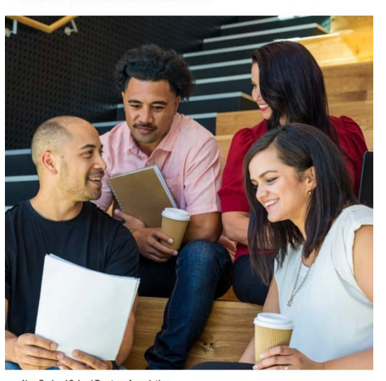
New Zealand School Trustees Association Te Whakaroputanga Kaitiaki Kura O Aotearoa

For more information, please contact the School Trustees Association on 08000 782435.