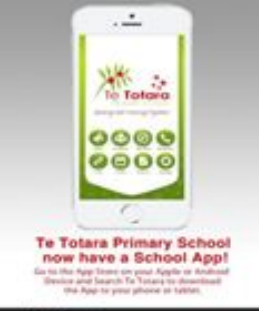
Page 1 of 6